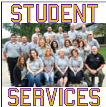
1st Semester Counseling Lessons & More

RHMS National Honor Society is sponsoring a Blood Drive on Tuesday, October 25,2022, from 7:30 am until 1:00 pm in the RMHS Field House. Appointments preferred; Walk-ins are welcome. Click here for additional information on how to sign up.