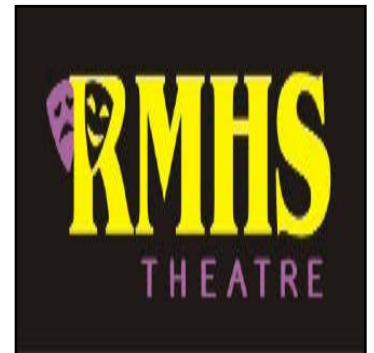
Auditions on 11/17/22 for “The Great Gatsby”