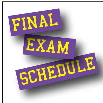
1st Semester Exams