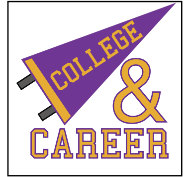
College & Career