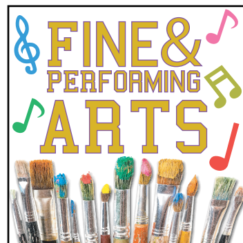
Upcoming Fine & Performing Arts Events